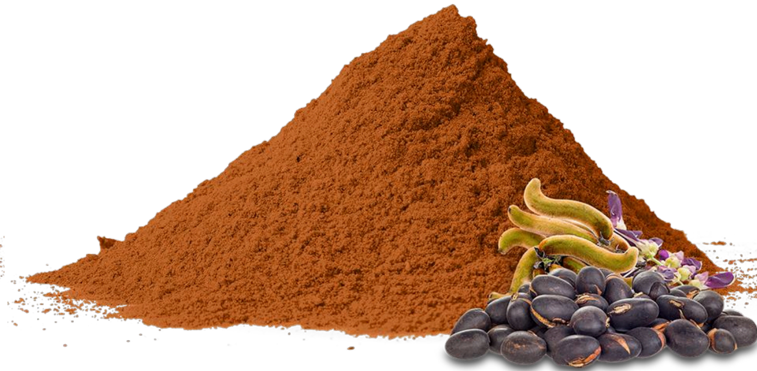
Mucuna Beans Extract