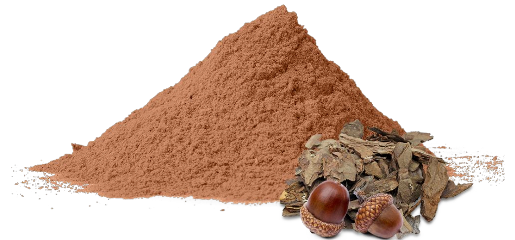
Himalayan Pine Bark Extract (Pinorox)