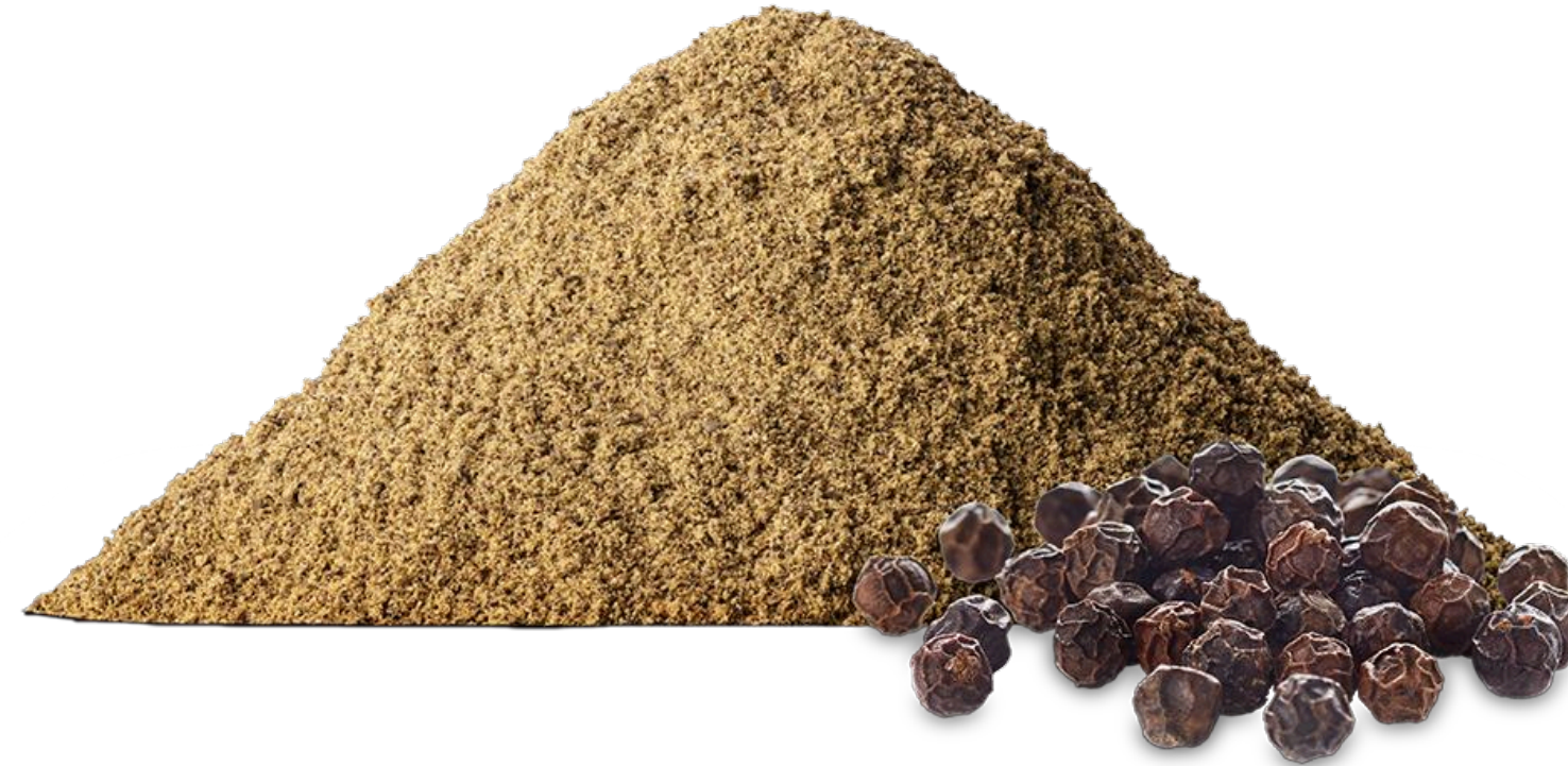
Black Pepper Extract