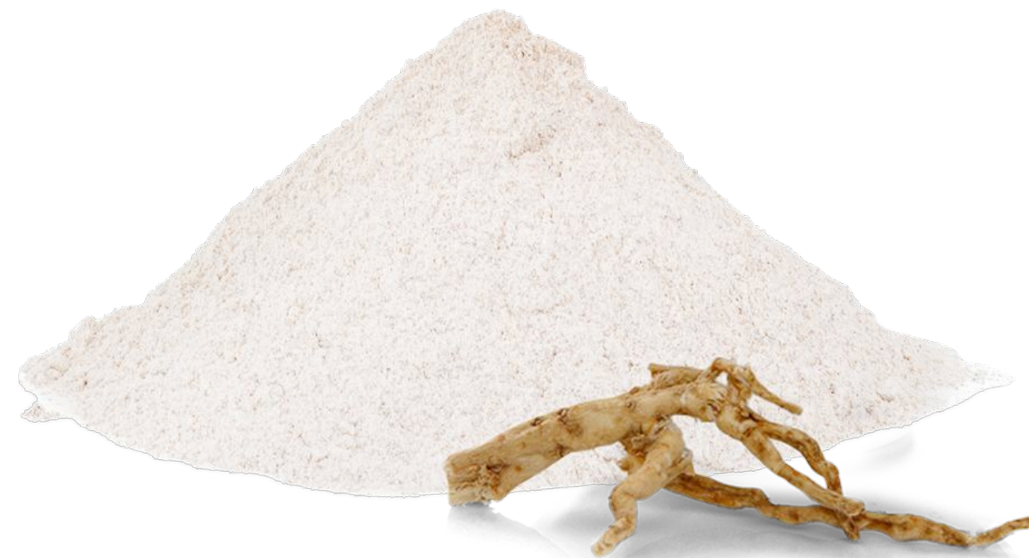
Ginseng Root Extract