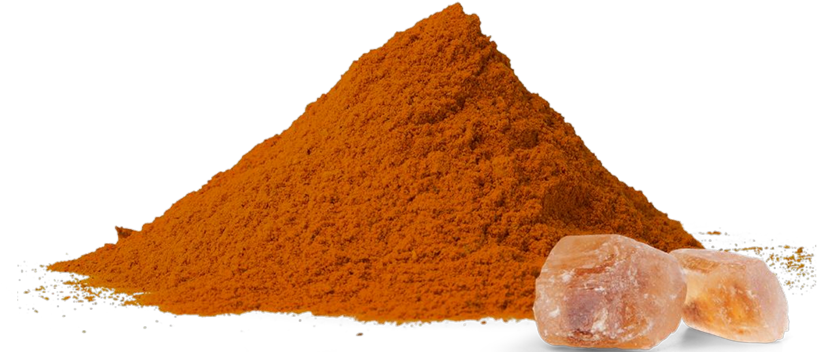
Boswellia Serrate Extract