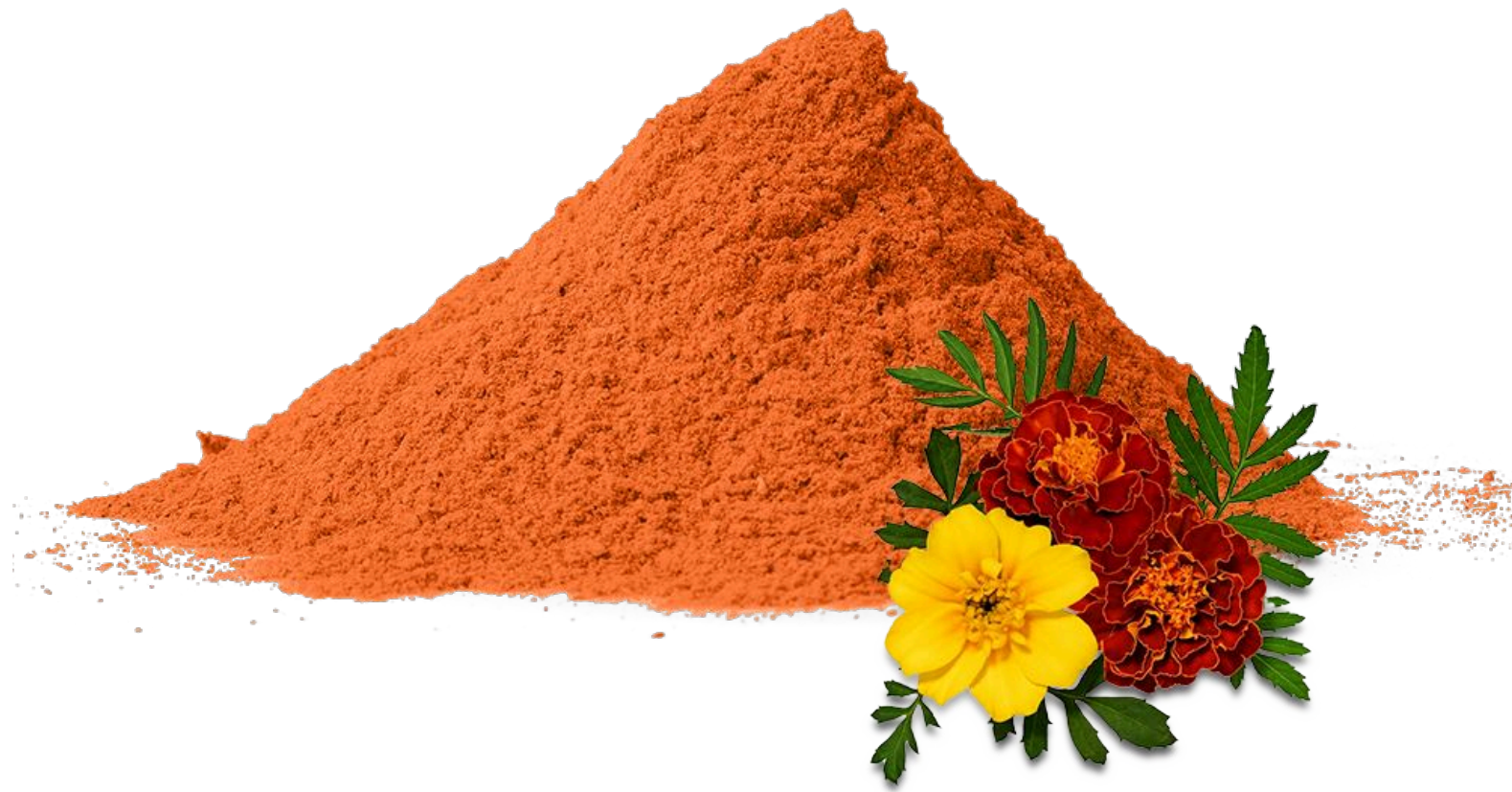
Lutein and Zeaxanthin