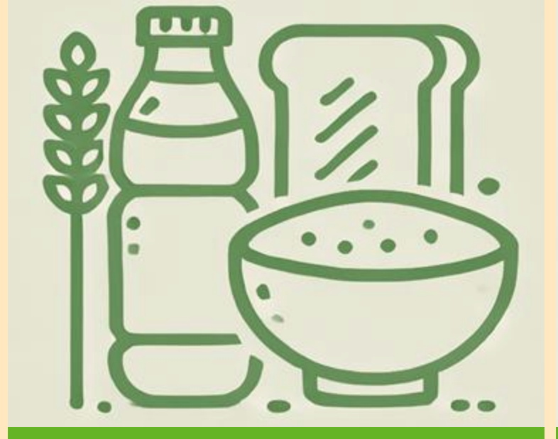
Food & Beverages