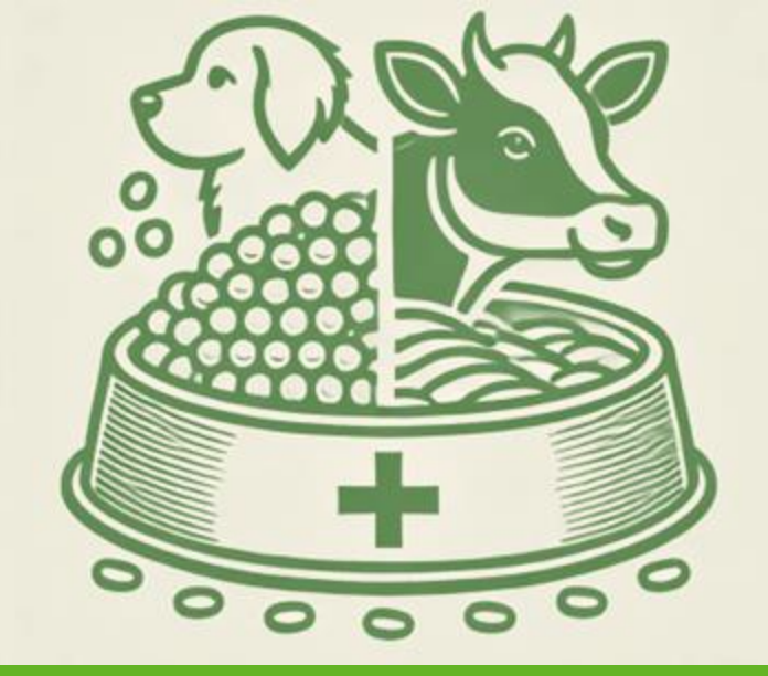
Pets & Animal Nutrition